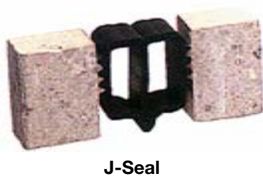
Figure 1 : MASTERFLEX J SEAL neoprene profile

A section through the J-seal profile bonded to Wabocrete II nosings is shown in Figure 2 (not to the scale).